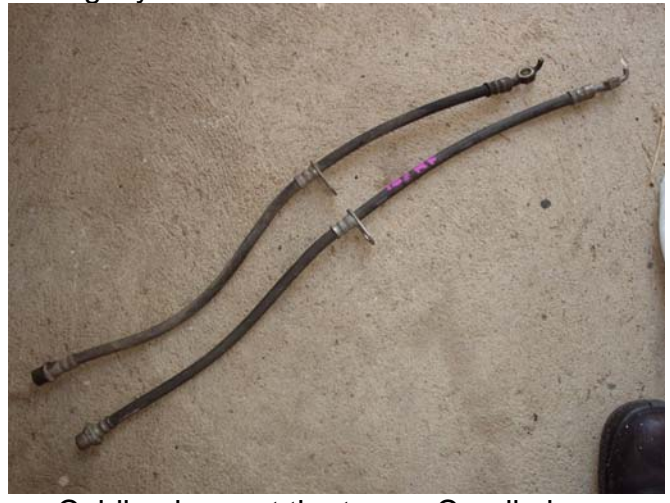
Caldina hose at the top vs Corolla hose

I was able to overcome this problem by using brake lines off of the ZZE122R Corolla. They were the same length from the car to the strut, but about 2cm longer from the strut to the calliper. To improve the length again, I bent the bracket that holds the brake line to the strut forward slightly.