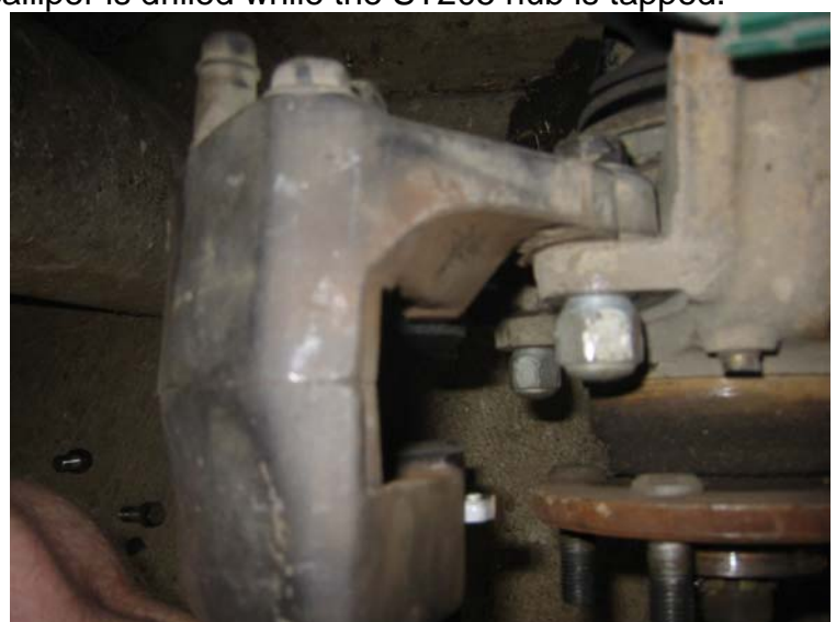
(The wheel nuts are temporary for mounting purposes)

The four piston calliper, due to its size is mounted on the other side of the hub. This means that the calliper is drilled while the ST205 hub is tapped.