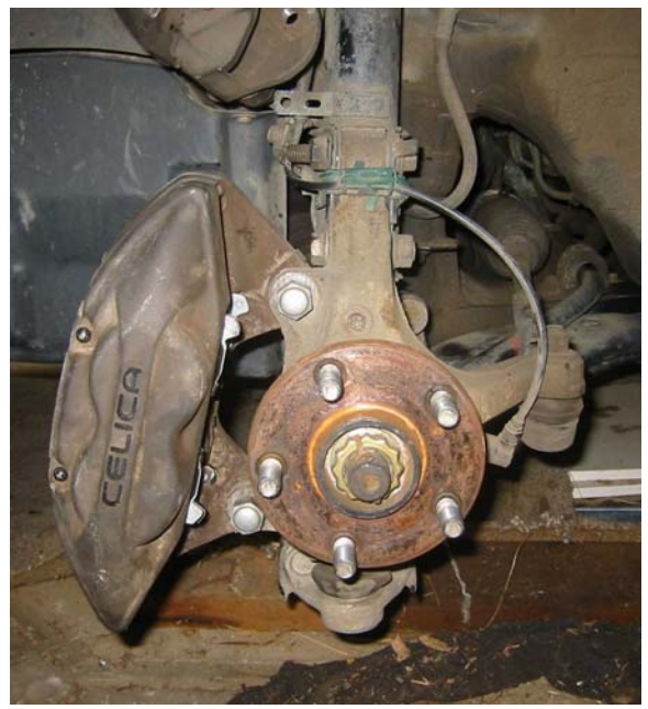
The extra wire with green clip is for the ABS

The bolts for the ST205 are the same overall diameter as the others