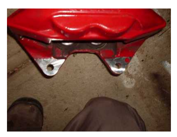
The discs now sits very close to centre on the calliper