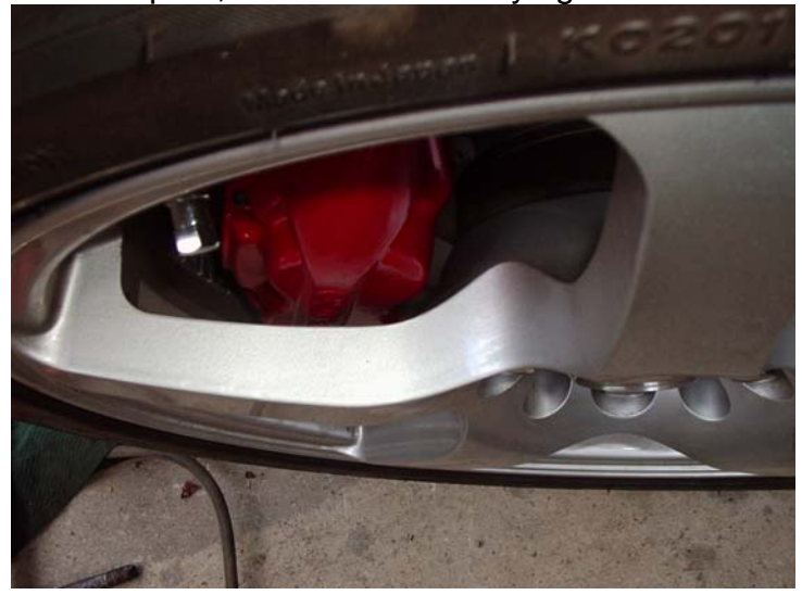
Tight clearance of about 5mm

Due to the width of the callipers, there is now a very tight fit between them & the wheel.