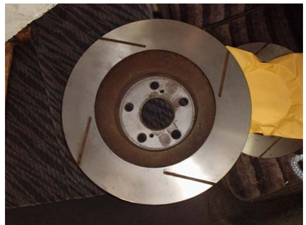
ST205 disc after being machined down to 300mm

The last hurdle is to get new front brake lines.