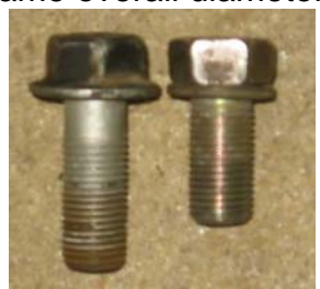
ST205 & ST185

The bolts for the ST205 are the same overall diameter as the others