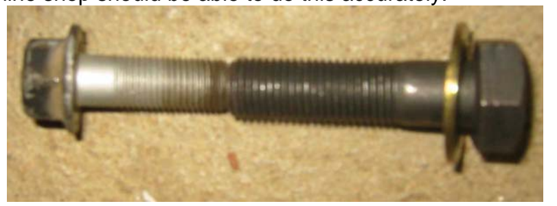
ST205 M12 bolt & replacement M14 bolt (yet to be shortened) These are all high tensile parts

This means the hubs need to be drilled out & tapped to accept a bigger bolt that will go through the ST205 calliper. The calliper also needs to be drilled out to accept the larger bolts. Any machine shop should be able to do this accurately.