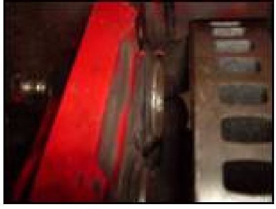
After fitting the discs, I found I had clearance problems with the lower ball joints.