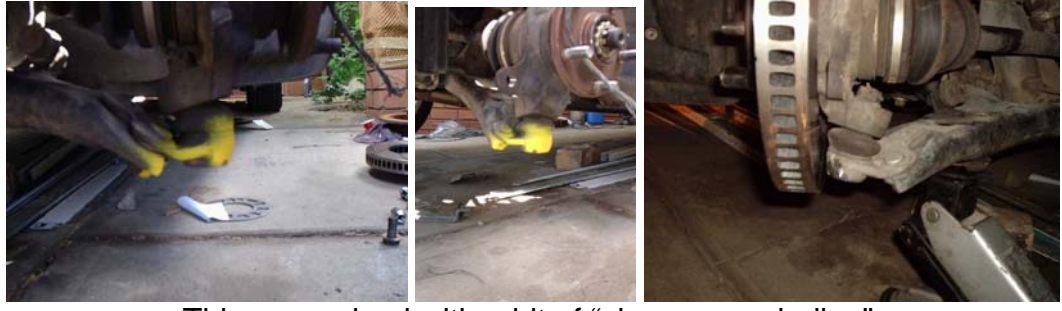
This was solved with a bit of "clearance grinding". Be warned though that you don't grind too much off the ball joint as you'll break into the inner case.