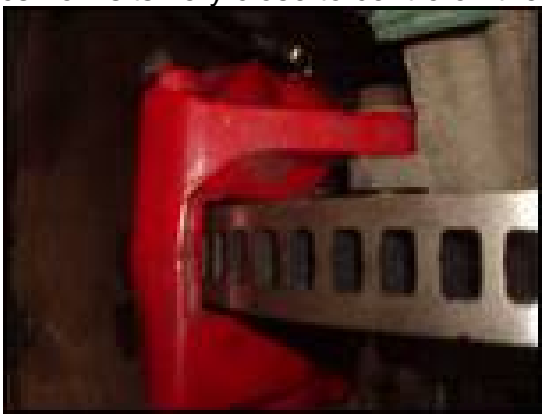
And there isn't much clearance, but this is how its meant to be: